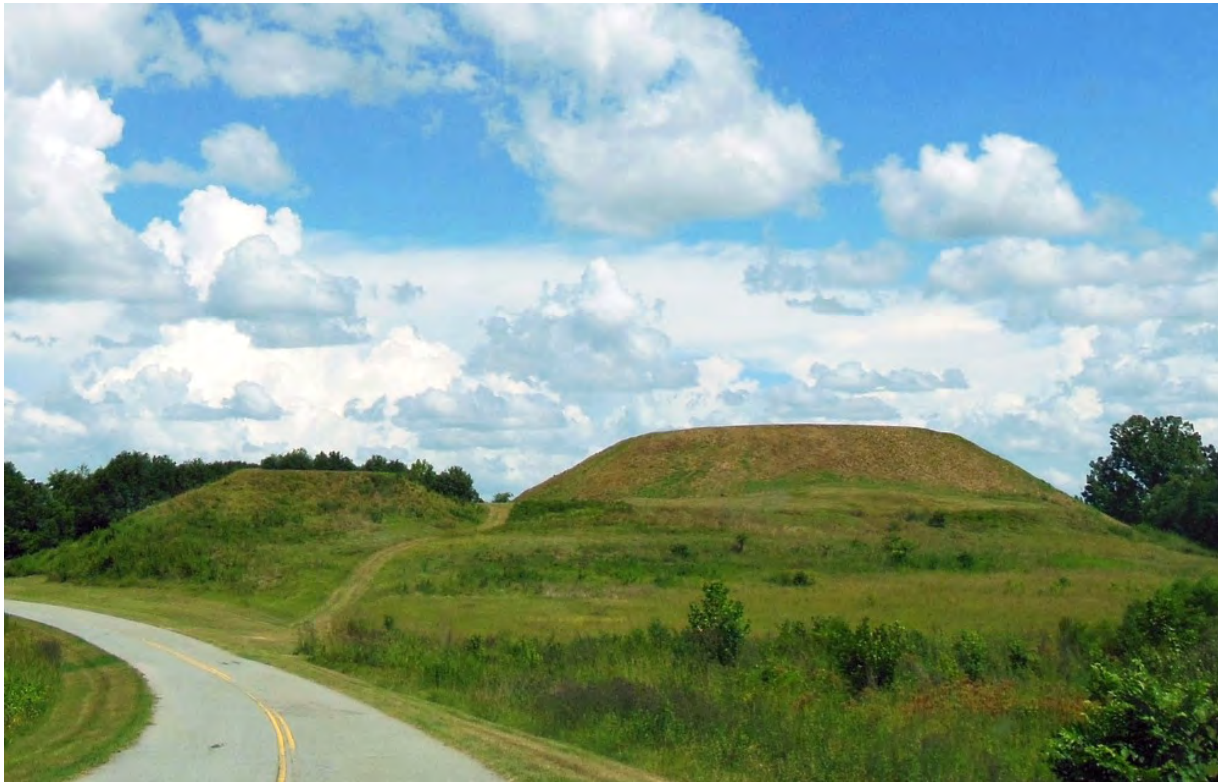
Photo: A view of Great Temple & Lesser Temple Mounds from the Funeral Mound.

The park contains some of the most significant Native American mounds in North America, including the only spiral staircase mound known to exist on the continent. The mounds are marvels of highly skilled engineering. The layers of earth and plant matter were used as religious structures and burial mounds, and the land was the ancestral homeland of the Muscogee (Creek) Nation, who were forcibly removed from the land in the 1800s and marched about a thousand miles from Georgia to Oklahoma along the Trail of Tears.